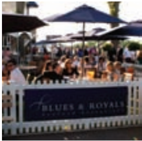
Blues & Royals restaurant

This unique al fresco seafood and champagne restaurant is set within the Club Enclosure and just yards away from the finishing post. It provides a stunning location for dining in style. Due to its popularity, early booking is advised.