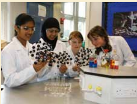
Salters' Chemistry Festival Winners