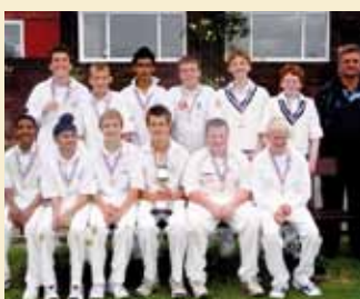
U13 Cricket Team – winners of the Lancashire Cup