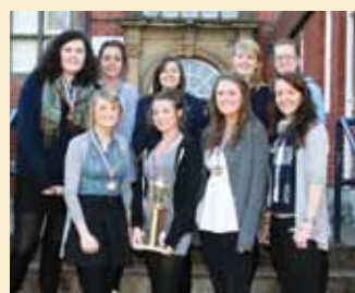
U19 Netball Team – Greater Manchester County Champions