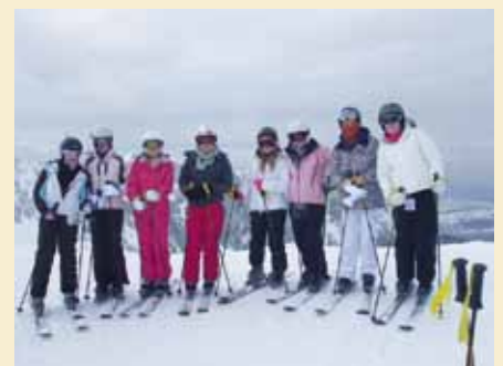
Ski Trip to Utah