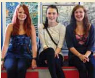
BGS Advanced Level Art