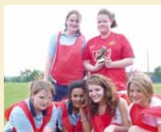
Winners of the Derrick Jones Football Trophy