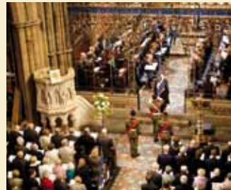
Founders' Day