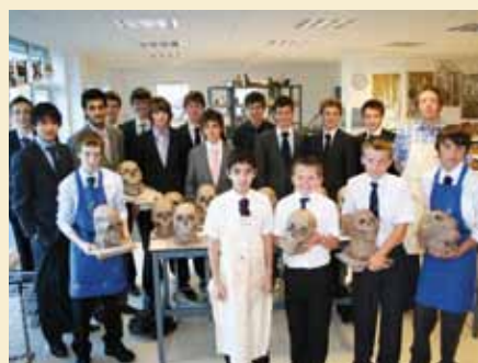
Don't Lose Your Head exhibition