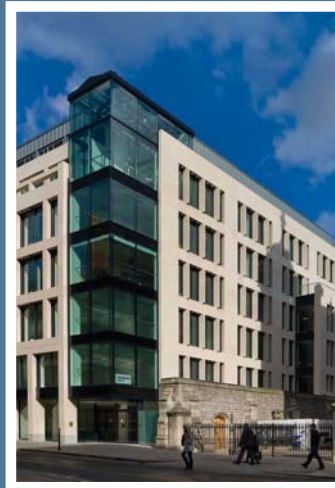
FENTONS, CHANCERY LANE, LONDON