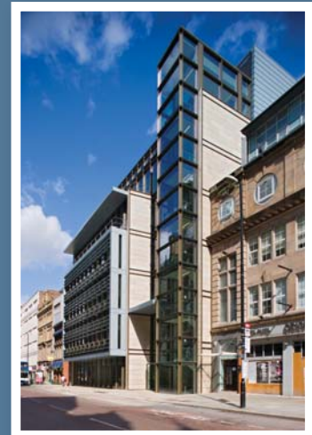
FENTONS, PRINCESS STREET, MANCHESTER