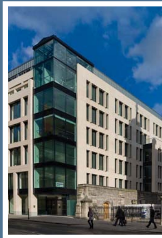
FENTONS, CHANCERY LANE, LONDON