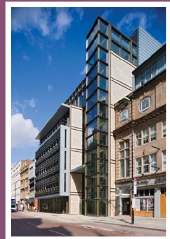
FENTONS, PRINCESS STREET, MANCHESTER