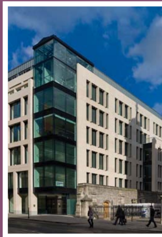
FENTONS, CHANCERY LANE, LONDON