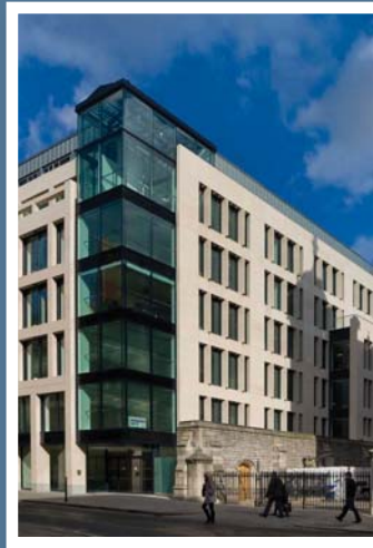
FENTONS, CHANCERY LANE, LONDON